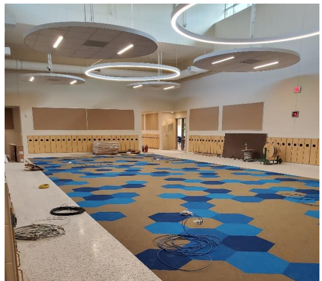
Area A LGI 2 nd Floor 9-4-20