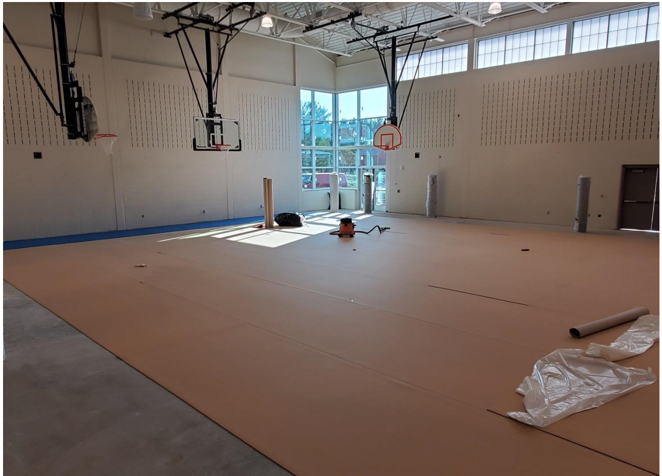
Gymnasium – Flooring System Install 9-4-20