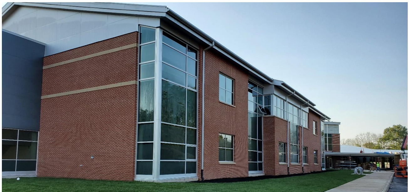
Area A - Classroom Wing Front 9-4-20