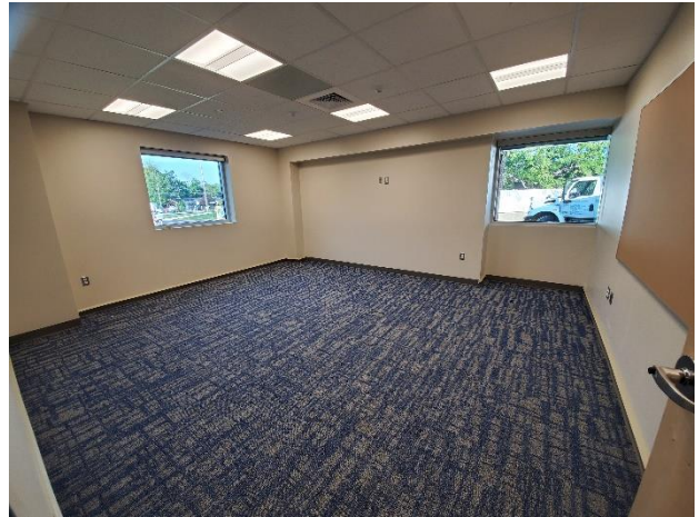
Administration Suite Guidance Office 9-4-20