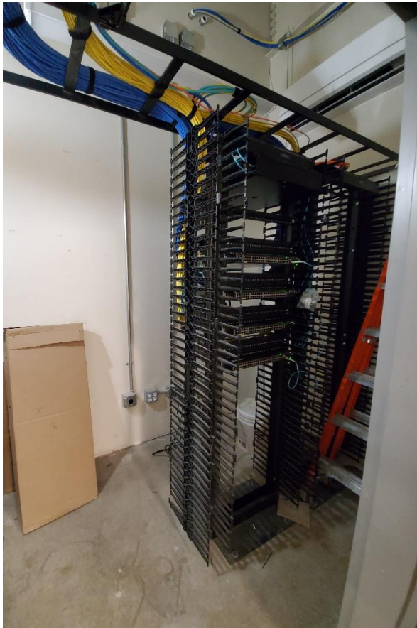
Intermediate Distribution Frame (IDF) 9-4-20