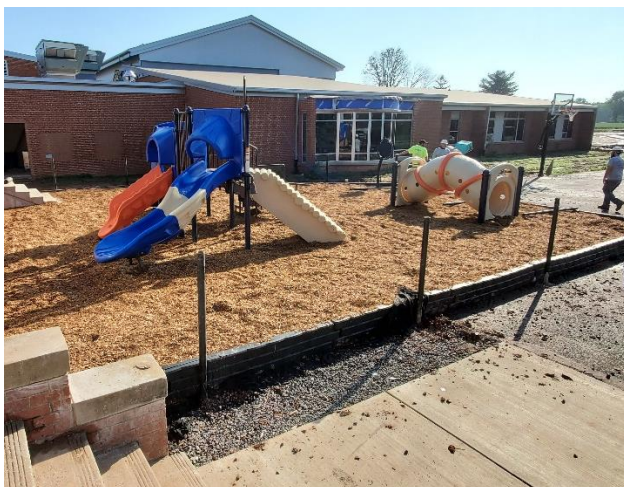
Rear Sitework – Playground equipment 9-4-20