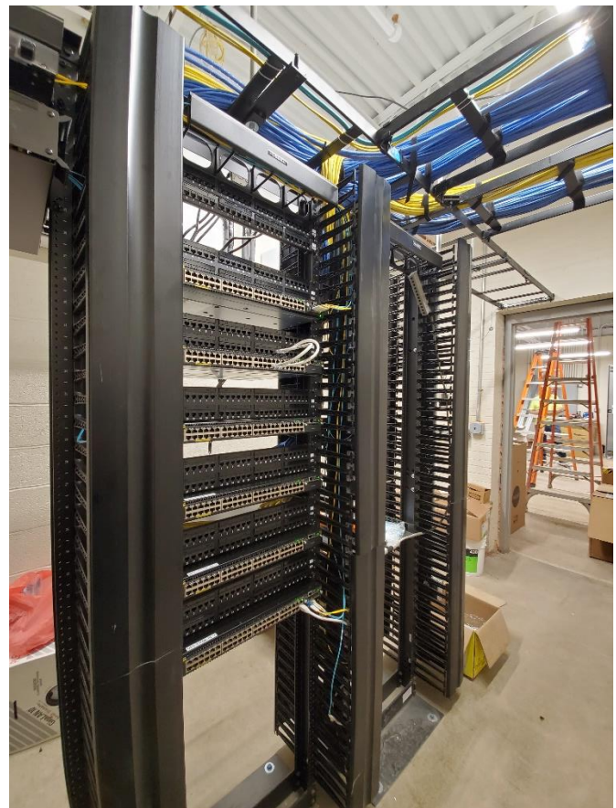
Main Distribution Frame (MDF) 9-4-20