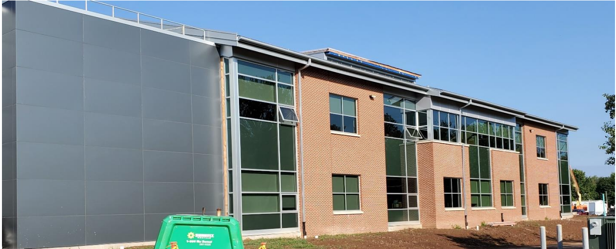
Area A - Classroom Wing Rear 9-4-20