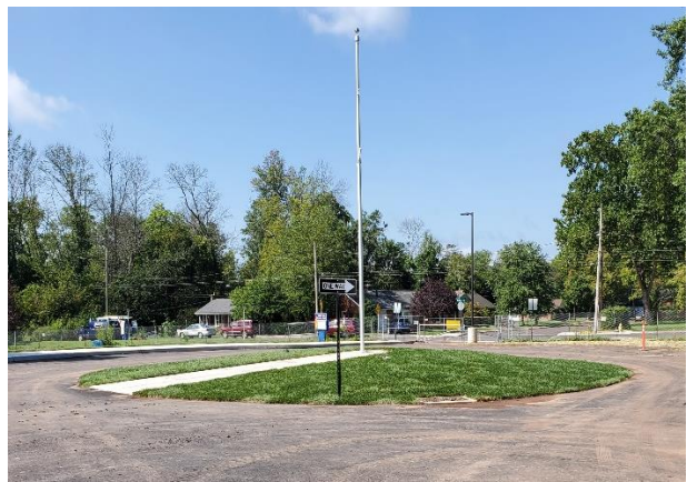
Parent Drop off Loop 9-4-20