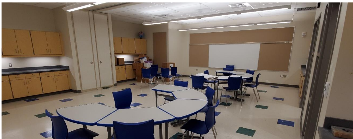
Area B SGI Room 9-4-20