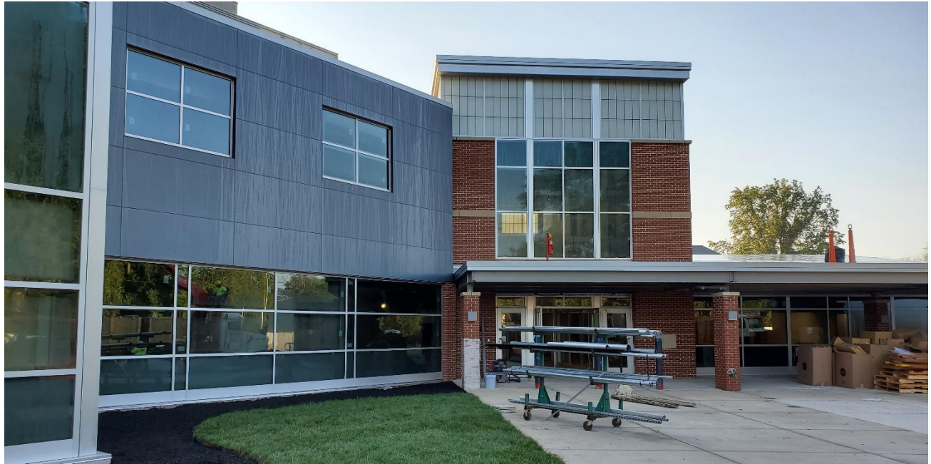
Main Entrance 9-4-20