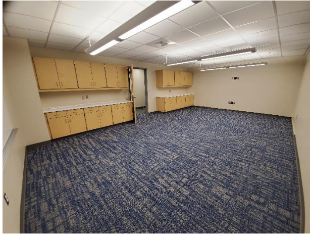
Administration Suite Conference Room 9-4-20