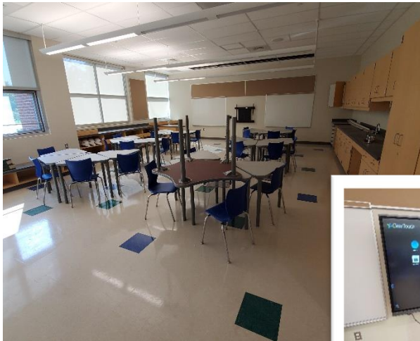
Area A Classroom 1 st Floor 9-4-20