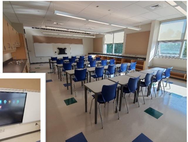
Area A Classroom 2 nd Floor 9-4-20