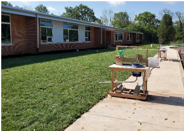
Front Sitework Area D Site Work 9-4-20